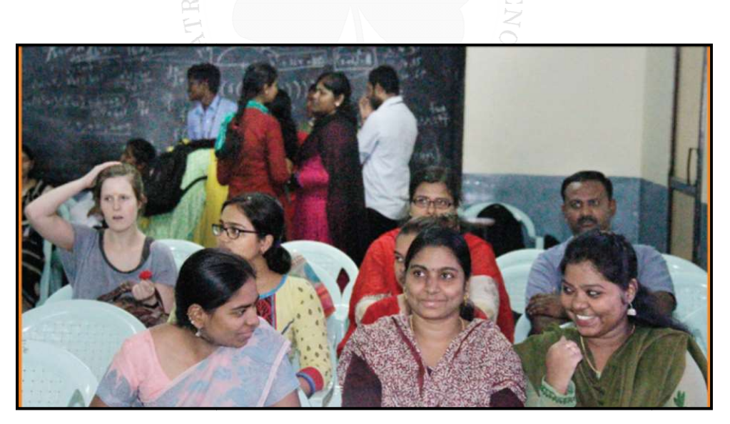
Participants during the programme on Human Trafficking