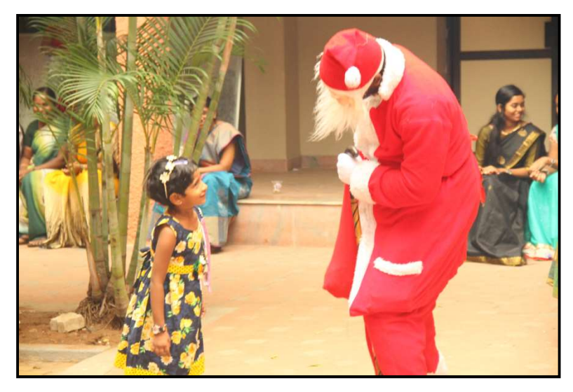
Santa Claus with the surprise Christmas gift