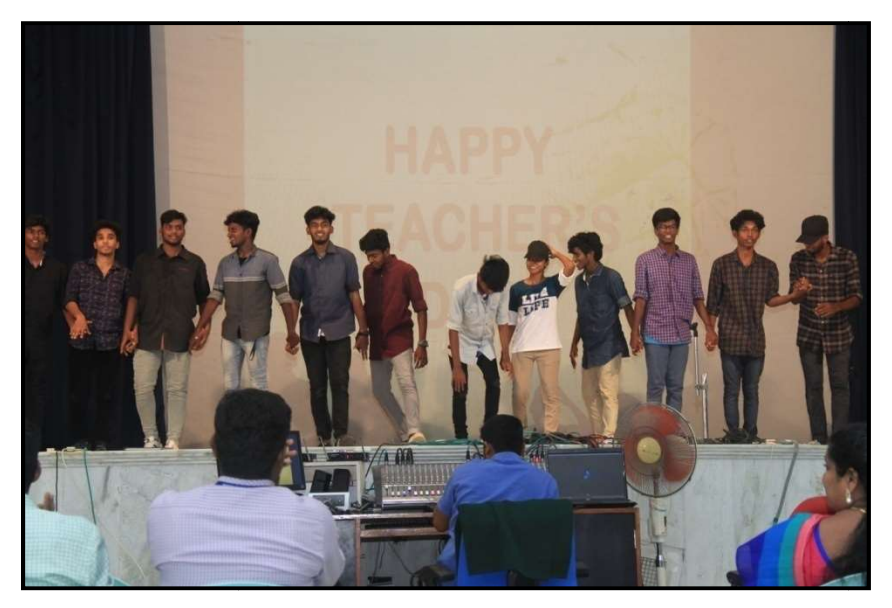
Students performing on Teachers day

Teacher's Day is celebrated to pay tribute to teachers, who have dedicated a considerable part of their life to impart moral and academic knowledge to their students. At Patrician College, the teacher's day Celebration was organized by the student council on the 5<sup>th</sup> of September, 2016 with great enthusiasm. Thanksgiving Holy Mass for the catholic staff and students was solemnized at the beginning of the day. Later the students union took to the floor and games were organized for teachers. In a truly sportive spirit, our young and vibrant Director and our Principal took to the stage with other staff members and shook a leg. The programme ended with distribution gifts, from the students union.